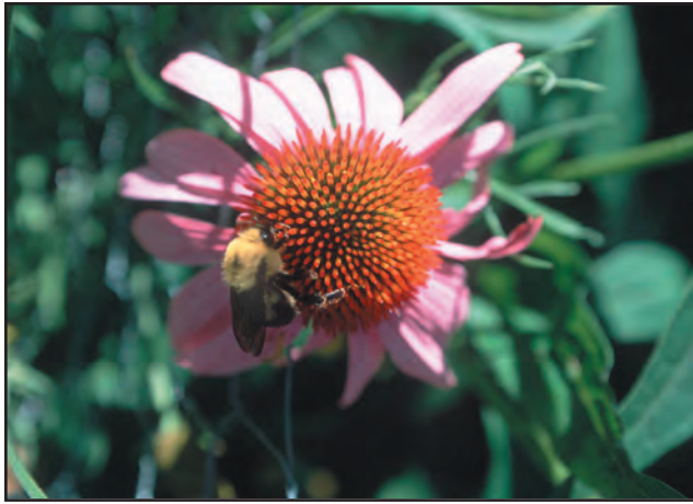
A bumblebee visits a purple coneflower.