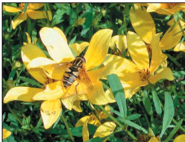
Charlie Rewa, NRCS

Flies and beetles are two important groups of native pollinators. Some flies resemble bees because they mimic bee coloration and patterns, allowing them to evade predation. Bees and flies both have transparent, membranous wings, but can be distinguished from one another because flies have two wings, while bees have four. Some pollinating beetles are quite small and difficult to see, resembling black specks on flowers, while others are large and colorful. There are hundreds of thousands of species of flies and beetles and many have yet to be identified. Habitat requirements vary from species to species. Flies and beetles require food, water, and cover in sufficient quality and quantity for each of their life stages (egg, larva, pupa, adult).