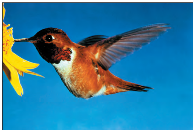
U.S. Fish and Wildlife Service

Hummingbirds are primarily woodland birds, occupying mixed woodlands, eastern deciduous forests, gardens, orchards, yards, overgrown pastures, citrus groves, scrub communities, hedgerows, and fence rows. They need trees, shrubs, and vines for shelter, shade, and nesting cover. Hummingbirds make their nests from downy plant fibers, such as thistle, dandelion, milkweed down, ferns, fireweed, young leaves, or moss, held together by spider silk and coated on