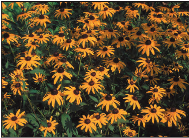
Clumps of flowers will attract more pollinators than individual plants. NRCS