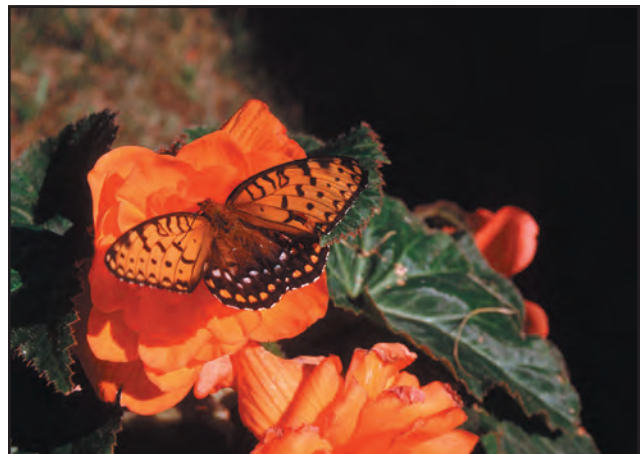
Butterflies are important pollinators of flowering plants.

After several weeks of eating and growing, caterpillars begin to transform into their adult forms. This transformation is called the pupa stage, and it is the non-feeding, stationary stage of a butterfly's life. Though they do not require food, pupae do need a protected site, such as a bush, tall grass, or a pile of leaves or sticks, on which to transform into their adult forms.