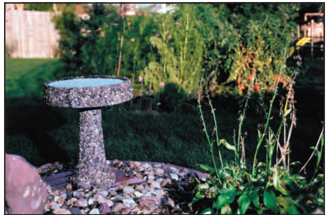
If natural sources of water are not available, birdbaths can provide water for many types of pollinators.

Pesticides, including herbicides and insecticides, do not discriminate between good species and bad species. An insecticide applied to eliminate a crop-eating insect may also kill valuable native pollinators. All groups of pollinators, as well as other wildlife, can be negatively affected or killed by pesticide use. Poisoning of pollinators may result from contaminated food (pollen and nectar), or directly from florets, leaves, soil, or other materials that may have come into contact with pesticides. Insecticide use should be reduced and herbicide use should be kept to a minimum to support the full range of native pollinators. Landowners should choose non-chemical or organic solutions to combat insect problems. If an insecticide is absolutely necessary, use the least toxic material possible, use it according to package directions, and treat plants at the time of day or period in the season when their flowers are not in bloom. Integrated Pest Management (IPM) is a critical component of safe habitat management for pollinators. For more information, see Fish and Wildlife Habitat Management