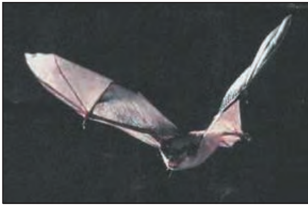
U.S. Fish and Wildlife Service

Many fruits rely on bats for pollination.